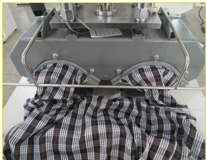
CF-2120 工作中 In working