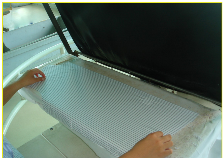
CF-2188 工作中 In working