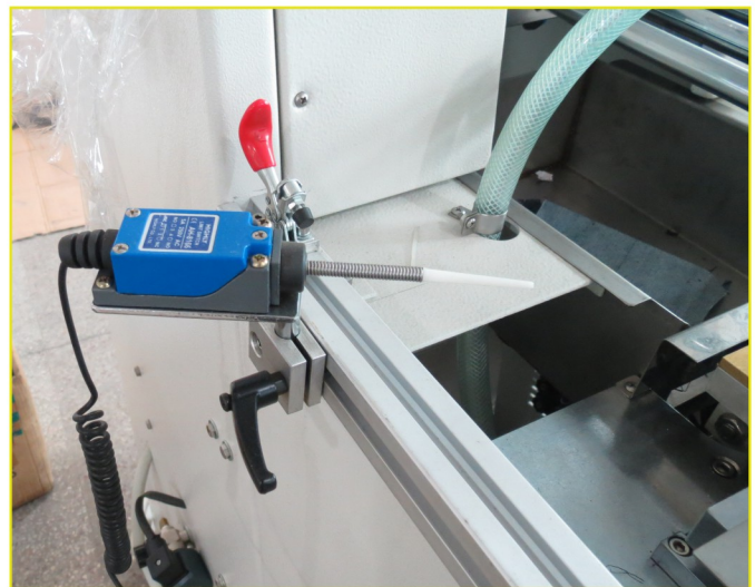
觸動開關 Touch switch