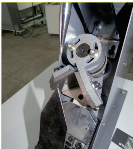
可調切咀 Adjustable cutting mouth

Removing the extra paper bits on the collar Needle provided for reversed collar sewing purposes Different angles can be set for upper cutting blade Optimum reversed collar effects. Pneumatically operated Highly efficient.