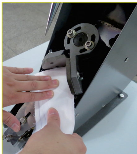
切領操作 Cutting collar operation