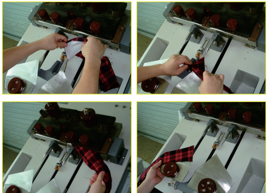
CF-53工作中 In working