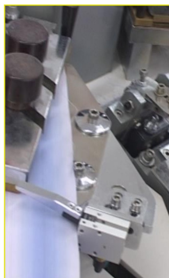
壓領 Press collar