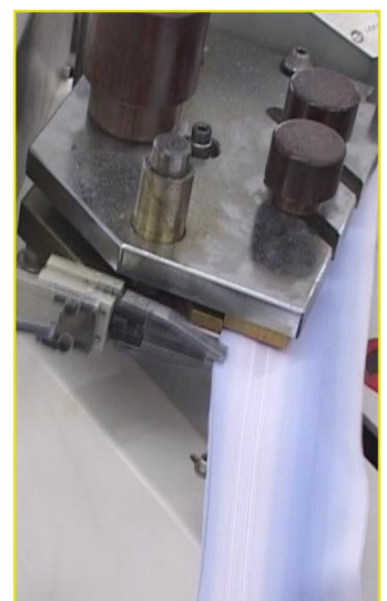
收領 Collect collar