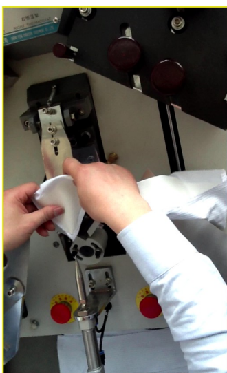
切領 Cut collar