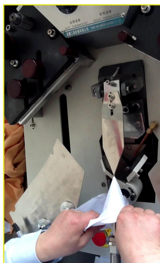
反領 Reverse collar