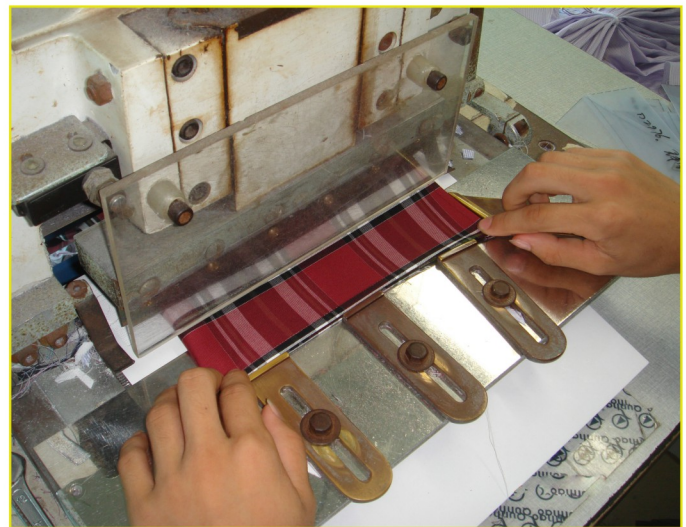
CF-92 工作中 In working