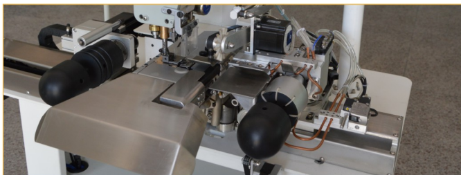
自动纠偏装置 Automatic Correction Device