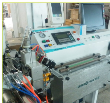
超聲波切帶/帶視覺攝像裝置 Ultrasonic cutting band with visual cameras