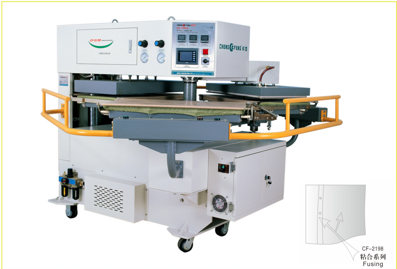
CF-2198 粘合系列 Fusing

Table three hot and cold head adhesive pressing machine