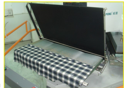
CF-2198 工作中 In working

Uses a three turntable rotation working way, equipped with liquid-cooled calibration unit, moulding fabric quickly, Stereo highlights. PLC touch control screen interface, more intelligent, more easily. Electromagnetic clutch system combines optoelectronic systems, fixed position more accurate. Oversized cylinder can meet the most fabric shaping requirements, and configuration of gas-liquid transfer system (own more powerful pressure), provide customer to choose, effectively solving the needs of different customers.