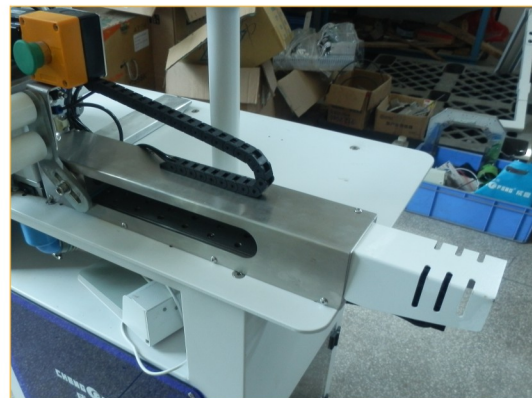
自动张紧装置 Automatic Tension Device