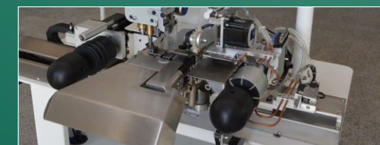
自动纠偏装置 Automatic Correction Device