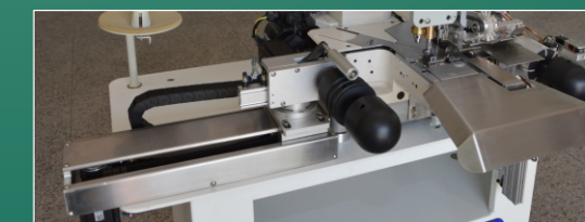
自动张紧装置 Automatic Tension Device