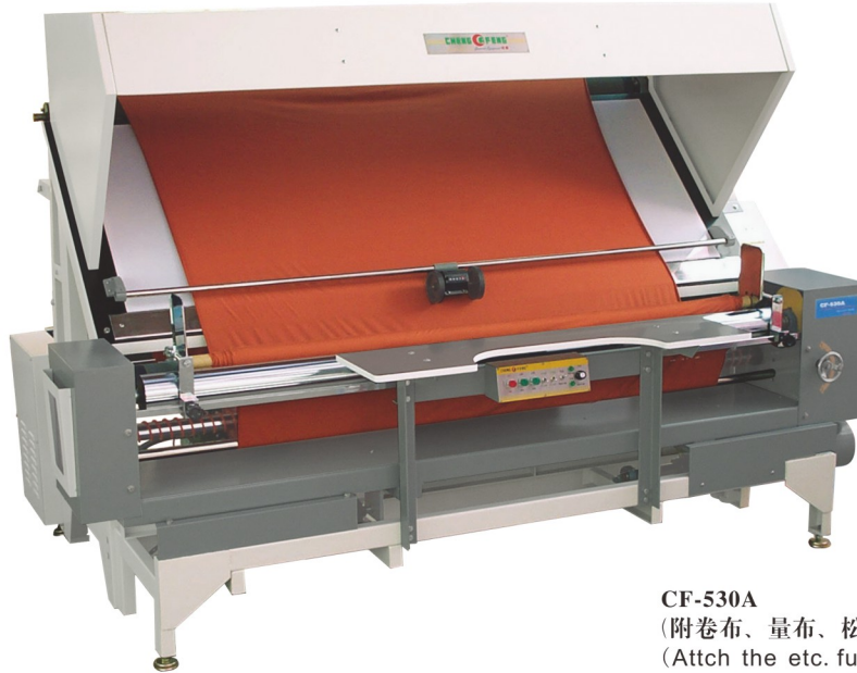
CF-530A (附卷布、量布、松布等功能) (Attach the etc. function of a cloth, pine cloth)

Automatic edge aligning and checking machinery functioned with colth reeling, measuring and releasing .etc