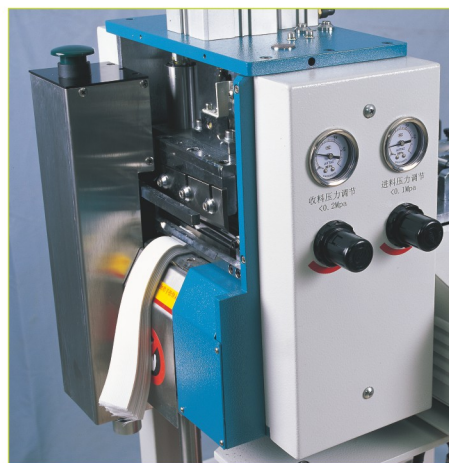
獨有的自動收料裝置 Unique automatic collecting device